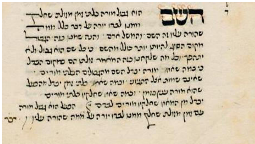
Table n. 2

On the contrary, in Judah Messer Leon (MS Florence, Biblioteca Mediceo-Laurenziana, Pluteus 88, n. 52, folios 8v, l. 17 – 9r, l. 9) it is written as follows: