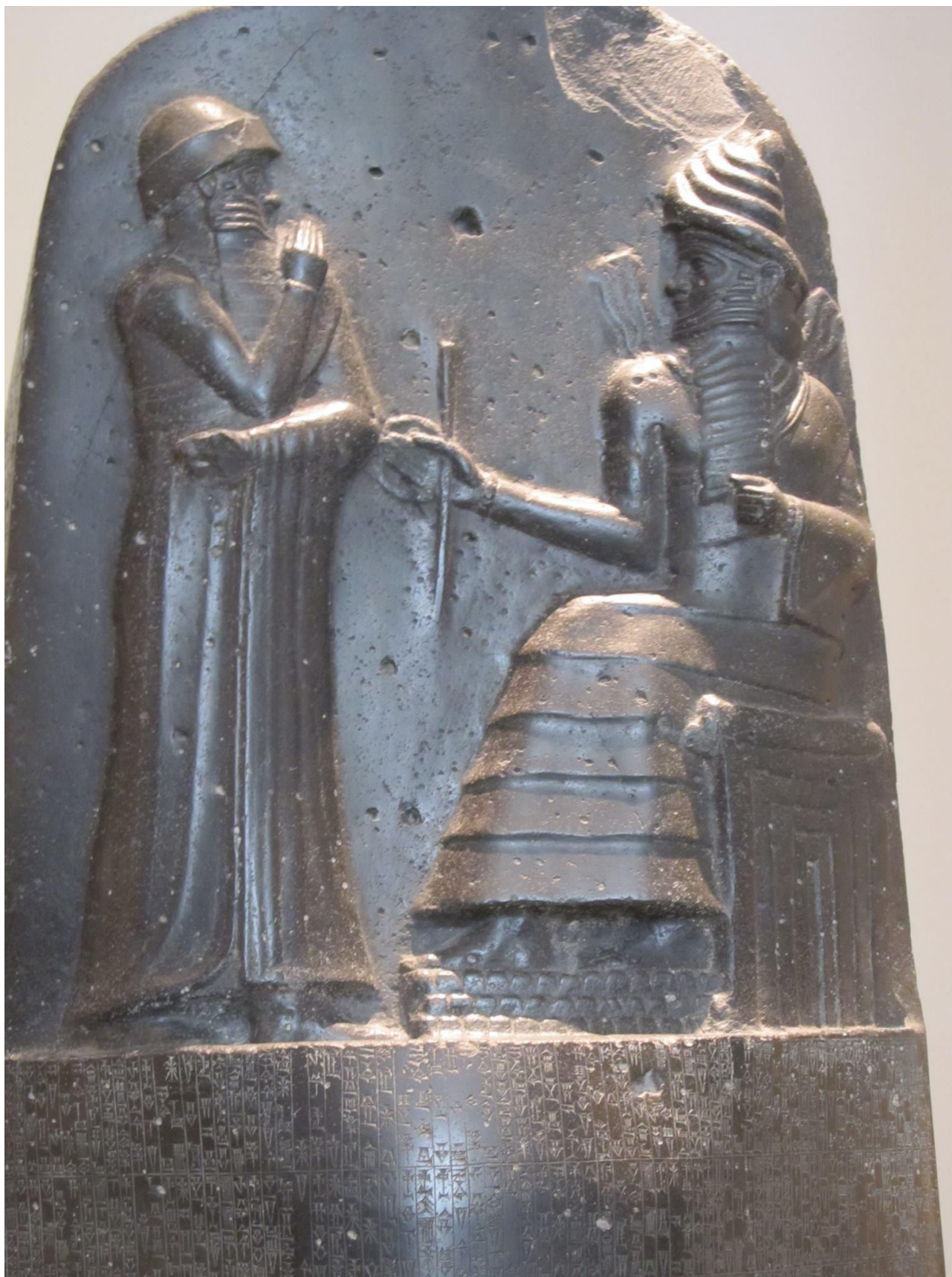
Figure 1. The stele of the Law Code of Hammurabi, Louvre Museum; by courtesy of Vladimir Sazonov.